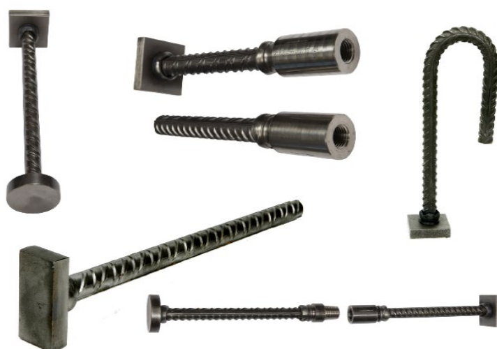
Figure 1 Examples of HRC products: HRC100 Series T-headed bars, HRC400 Series rebar couplers, and HRC720 threaded sleeves

The rebar is cut to length according to the production order. Small, unusable cut-off lengths are collected and sent to recycling. The raw material for end-components is cut to correct length/geometry. Threaded components (rebar couplers and cast-in connections) are processed by CNC-machines. Small, unusable cut-off lengths and swarf from cutting and CNC-machining are collected and sent to recycling. The end components are attached to the rebar by friction welding. The process uses no additional material or consumables. If required by the production order, products are bent by a rebar bending machine.